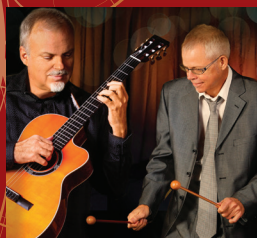
THE BURCHFIELD BROTHERS